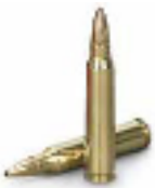
5.56mm JHP hunting ammunition

5.56mm ammunition comes in a wide variety of constructions. The rounds with lead cores typically used for hunting and target shooting can be stopped with Level III hard armor plates.