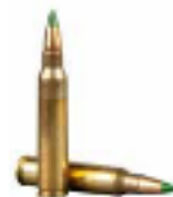
5.56mm FMJ, M855 "Green Tip" partial steel core ammunition

5.56mm ammunition comes in a wide variety of constructions. The rounds with lead cores typically used for hunting and target shooting can be stopped with Level III hard armor plates.