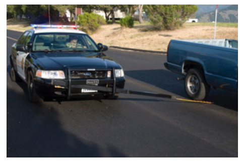
The MobileSpike device enables officers to stop pursuits from the safety of their vehicle with a push of a button.