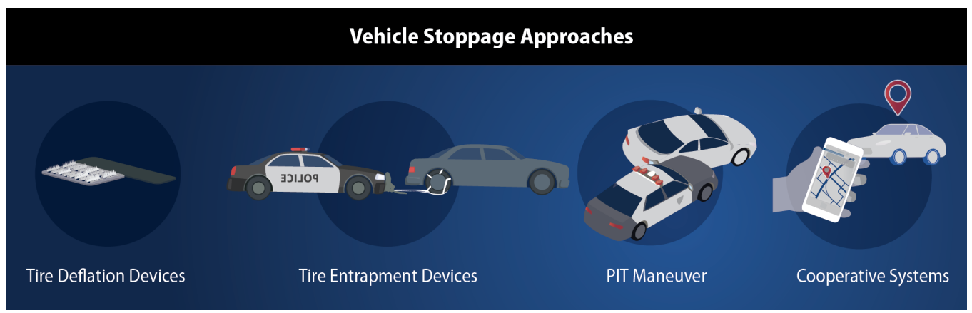
Figure 5: Agencies can leverage one or a combination of approaches to resolve a pursuit. Many of these approaches involve the use of commercially available devices meant to be deployed during an active pursuit.

Deployment of vehicle stoppage tools and techniques, including tire deflation devices, tire entrapment devices, and the PIT maneuver, often requires close contact with the fleeing vehicle either by pursuing, physically engaging with, or getting ahead of the vehicle. Law enforcement officers employing these tools and techniques also have to consider bystanders, vehicles not involved with the pursuit, and infrastructure. Some tools can be deployed at a distance or controlled remotely, effectively alleviating the need for an officer or a police vehicle to be in the direct path of a fleeing vehicle.