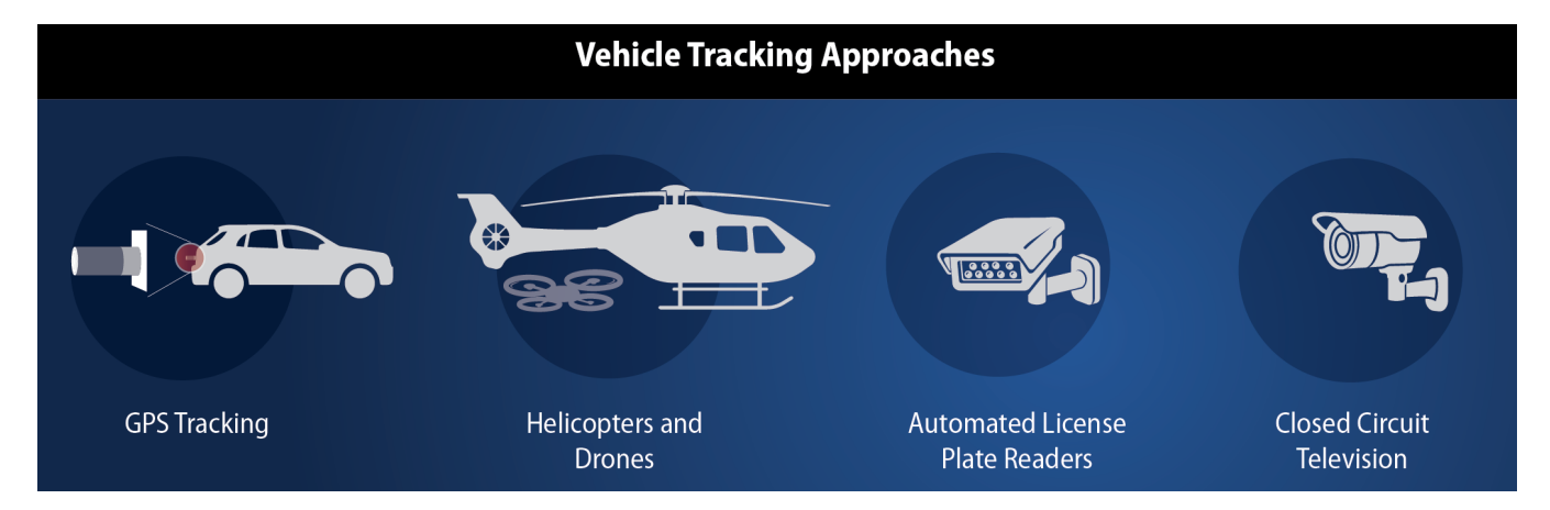
Figure 6: Agencies can leverage alternative approaches to pursuing a fleeing vehicle; these tools can be used with traditional pursuit methods or in place of them if the agency has strict no-pursuit policies.

Vehicle tracking approaches, shown in Figure 6 , may be used with approaches that stop vehicles. Some tools require close proximity of law enforcement to the fleeing vehicle, while others enable remote law enforcement intervention. Some approaches rely on surveillance technologies, like cameras and sensors, to direct officers to the general location and direction in which the fleeing vehicle is traveling. Tracking can prevent a police pursuit from escalating into a high-speed chase that may endanger the lives of officers, suspects, and bystanders.