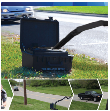
The NightHawk device extends retractable spikes using a gas-propellant deployment system.

One tire deflation device that is not deployed from the side of the road is the MobileSpike device, which employs an electrically extended spike bar that is mounted to the bumper of a police cruiser. This device allows the police officer to remain in their vehicle during deployment but requires the officer to chase and maintain a close distance to